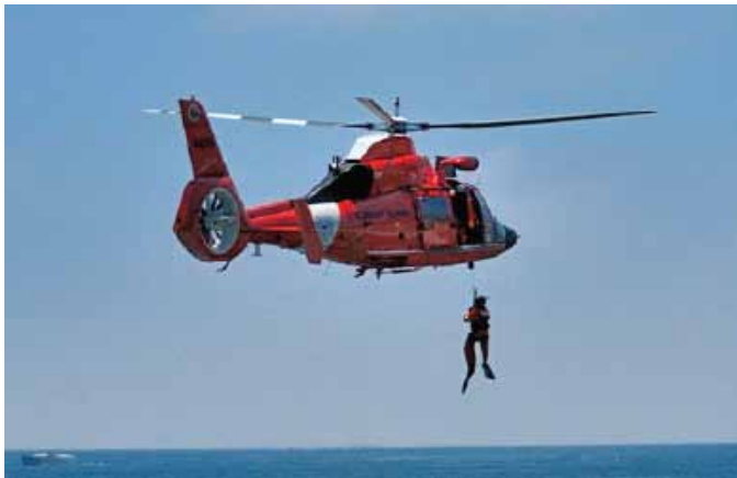
See the U.S. Coast Guard Air-Sea Rescue Demonstration by the U.S. Coast Guard Air Station Los Angeles and Bay Watch

> All Contributions Are Tax Deductible: Navy League is a 501(C)(3) Corporation <