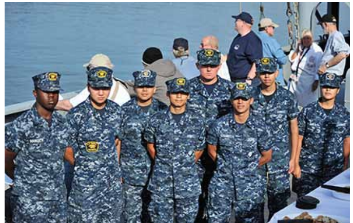
Meet The SS Lane Victory Division Sea Cadet Corps Help us support our young Sea Cadets

Please cut or tear above. Complete this Reservation form and mail it with your check made payable to: BHC/NLUS